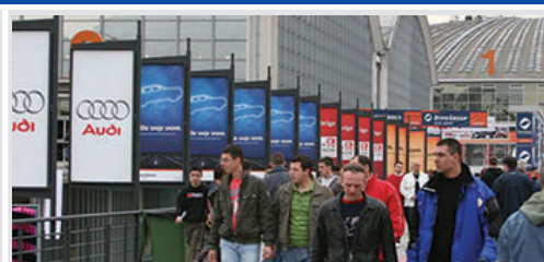
Double sided billboard on the pedestrian bridge, 95x195 cm, paper 105 €/piece pcs.