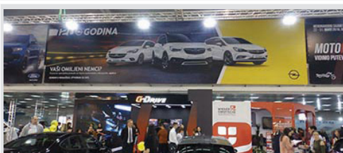
Advertising surface on the vinyl per sq.m. 33 €/sq.m sq.m