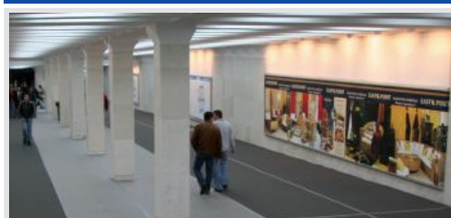
Megaboard, Underground Passage, 995x195 cm, paper, illuminated 520 €/piece pcs.