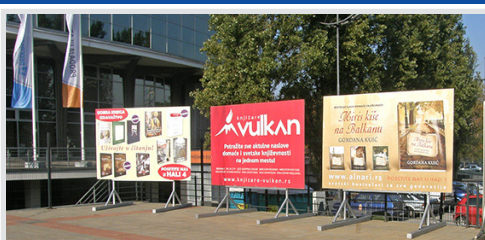
Billboard 300x200 cm, paper 240 €/piece pcs.