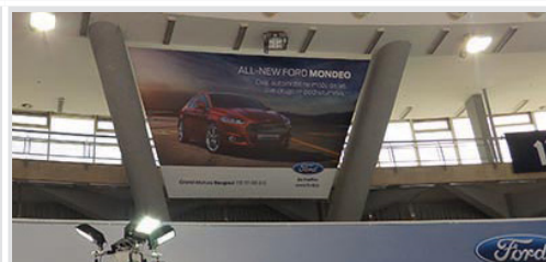
Megaboard at Hall 1, V-banner, vinyl, 735x427 cm 990 €/piece pcs.