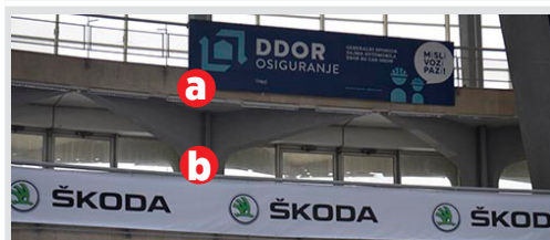
a) Billboard 6x1.5m 170 €/piece pcs. b) Vinyl on railing above the stand 33 €/sq.m sq.m