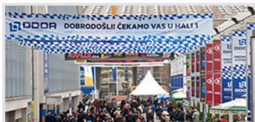
Colonnade in front of the Hall 2 vinyl 8x1 m, incl. 4 billboards, 95x195 cm 580 €/piece pcs.